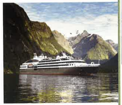
Dramatic scenery on a Ponant cruise