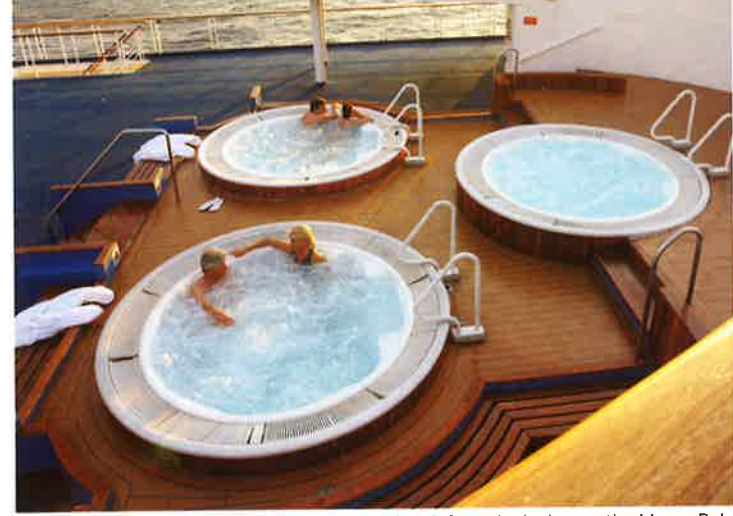
Dining, left, and relaxing on the Marco Polo